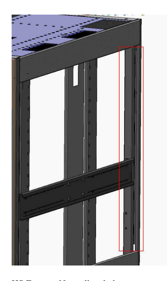
HS Frame – No toolless holes on the backside of the frame.

The toolless mounting holes on the backside of the frame of the NetShelter HS have been removed. See below: