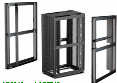
AR3340 and AR7742