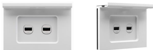
Saturn Zen Twin USB with Charging Shelf

With BC1.2 compliance and cable compensation, the 30USBCM optimizes the charging voltage and current to minimize charge time of your portable device.