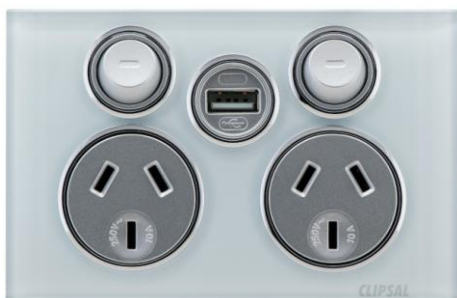
Saturn DGPO with 30USBCM Charger in Ocean Mist